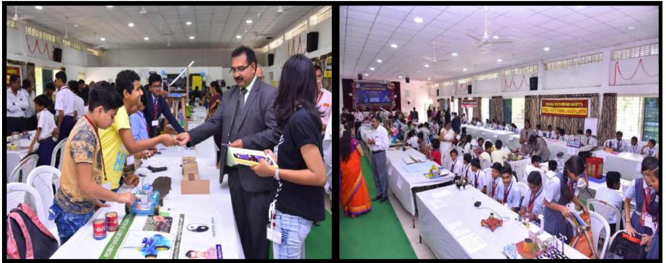
Techno Exhibition (Science & Tecnology Exhibition) for School Students from 5 th to 10 th standard