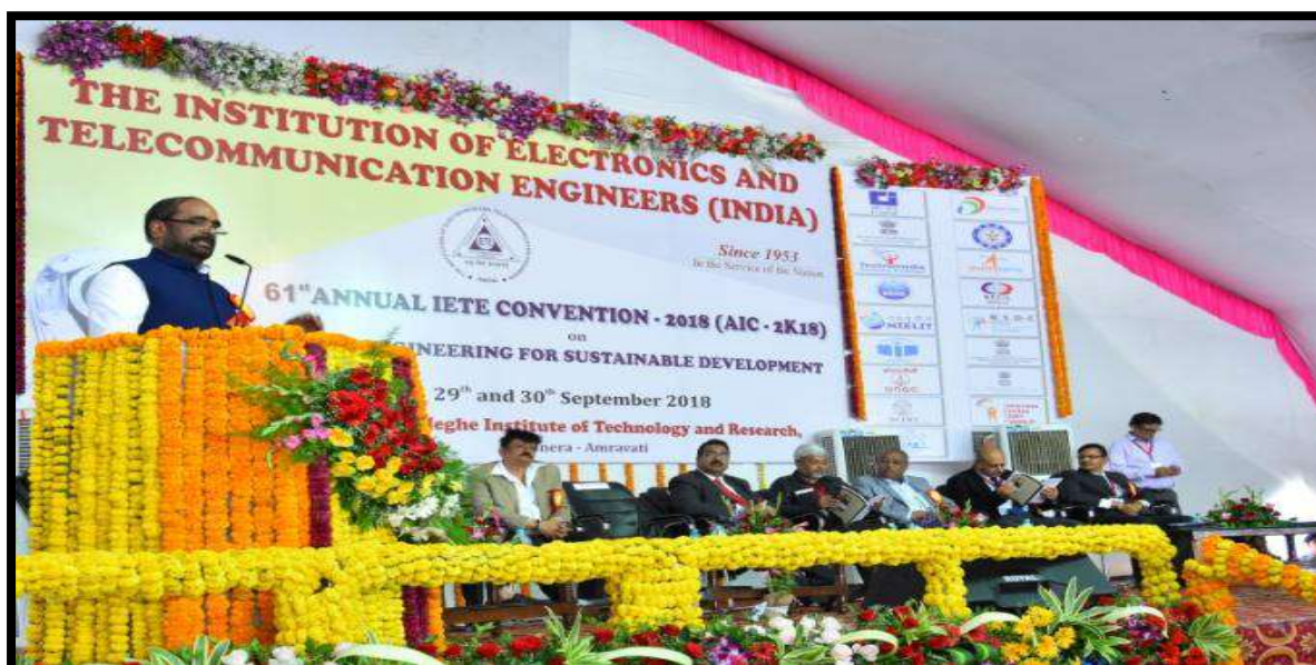
Hon. Shri. Hansraj Ahir addressing to gathering at Inaugural Function