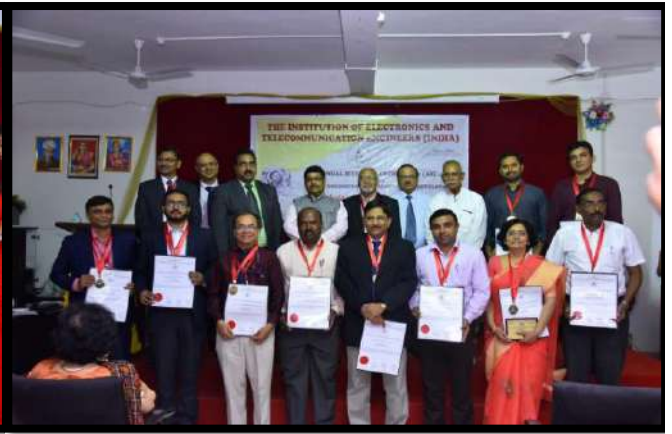
IETE awards to recognize excellence in scientific endeavor.