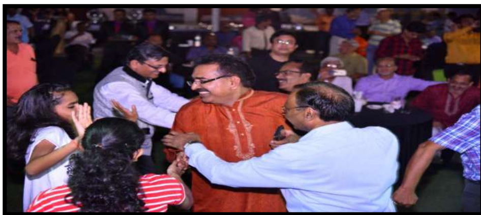
Cultural program by Amravati Center